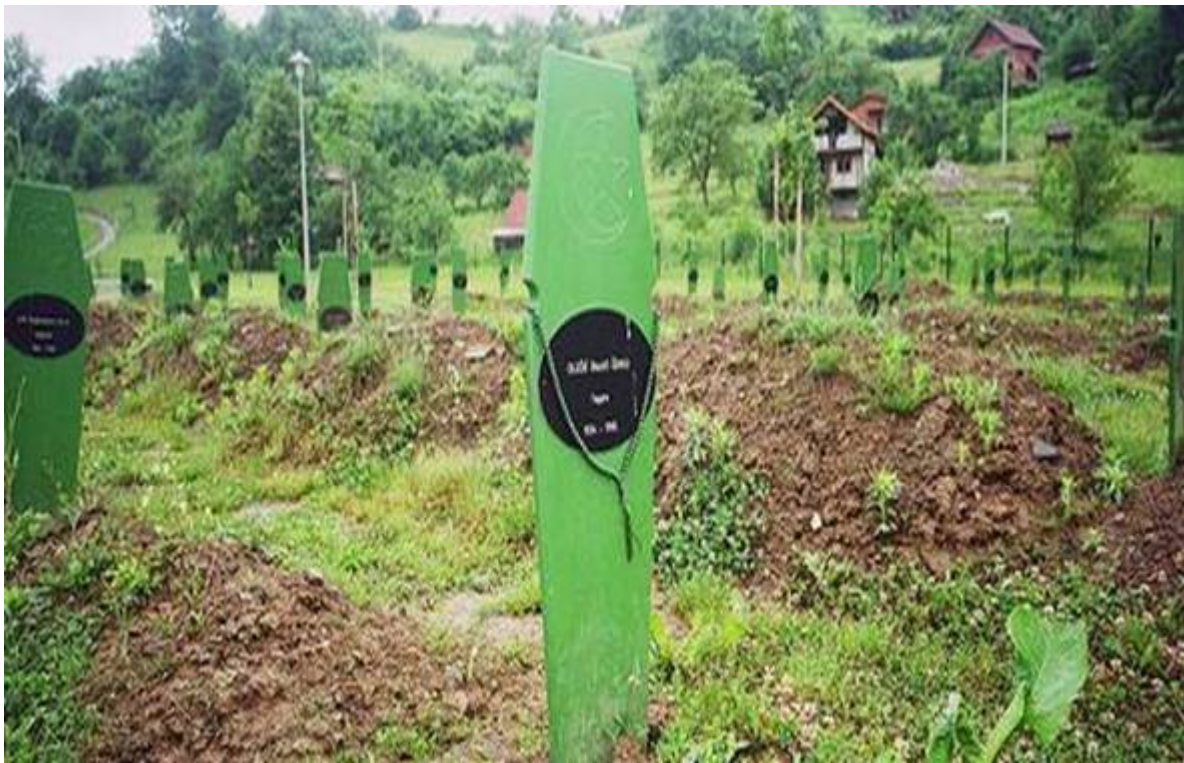
A genocide against Balkan Muslims: Srebrenica 1995

However, in recent international usage the term "genocide" is not limited to "acts equivalent to the Holocaust". When Hutu apologists claimed that the 1994 Rwandan genocide was a continuation of civil war, and a defensive act intended to pre-empt genocide at Tutsi hands (which Hutus had suffered in neighbouring Burundi in 1972), the International Criminal Tribunal for Rwanda rejected the argument.