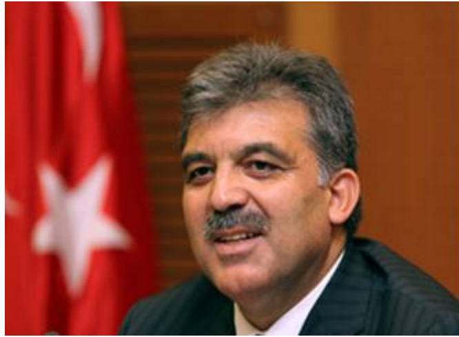
Ahmet Davutoglu and Abdullah Gul – Architects of Turkey's new foreign policy