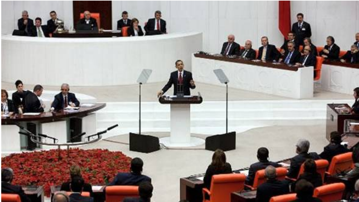
US President Barack Obama speaking to the Turkish Parliament on 6 April 2009.

reaffirm what they have already stated repeatedly. To date, 42 out of 50 US states representing 85 percent of the US population, have, by legislation or proclamation, recognized the Armenian Genocide.