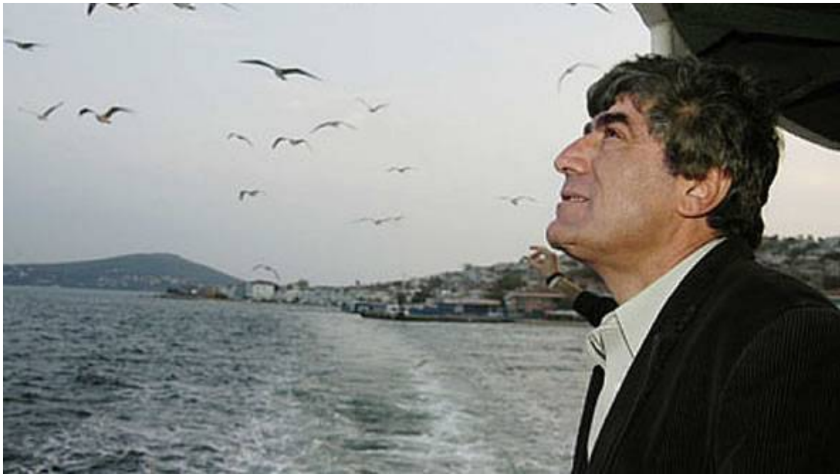
Hrant Dink

Turkey's friends and the international debate on the Armenian Genocide